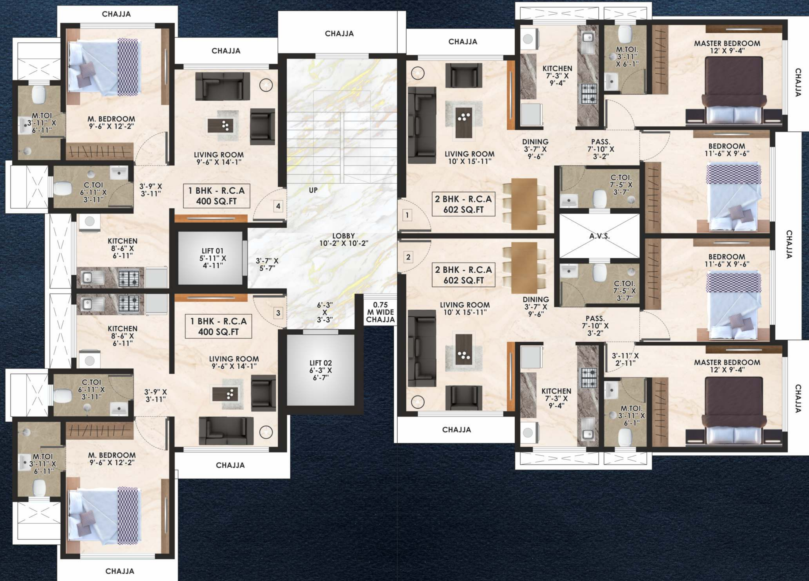
TYPICAL | 1ST TO 9TH FLOOR PLAN